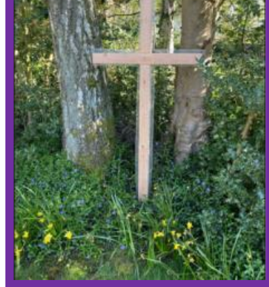
At 7:30 am