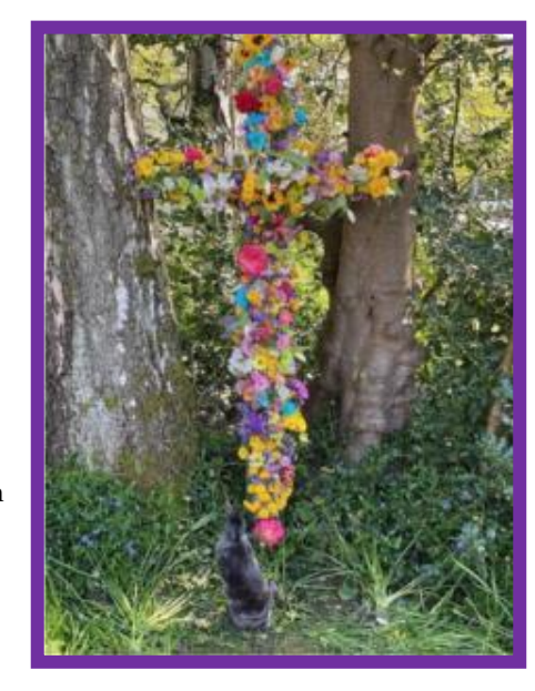
At 3:00 pm

Emily comments: "It was indeed a spectacular and life-giving day getting to see this cross that we put in our yard for Easter 2020 be filled with glory through the day.