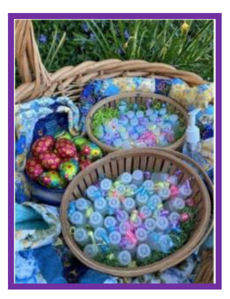
The Huff family placed a basket of bubbles and chocolate eggs near the cross for the many visitors to take home.

Though we are grateful for online communication, there is nothing like seeing real people rather than the one-inch picture of someone on your screen during a Zoom call. We were so blessed to get to see friends come by (6 feet away, of course) to flower our Easter cross. We hope to make this a new tradition, and we look forward to being able to actually hug friends who come by next year."