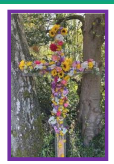
At 11:30 am